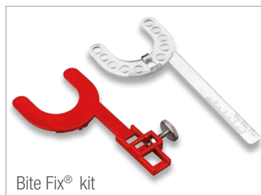
Bite Fix® kit