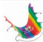
Orthodontic retainer and expansion plate Material: BIOCRYL® M (multicoloured)