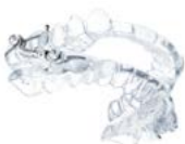
IST®-Appliance Material: DURAN®