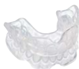
Positioner Material: BIOPLAST® (transparent)