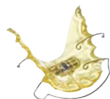
Orthodontic retainer and expansion plate Material: BIOCRYL® C