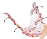
Temporary dentures Material: BIOCRYL® C (rose transparent)