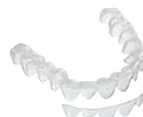
Bleaching splint Material: COPYPLAST® or BIOPLAST® bleach