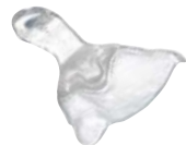
Individual impression tray Material: IMPRELON® (clear or opaque)