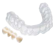
Moulds for temporaries Material: COPYPLAST®