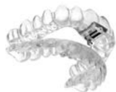
TAP® splints Material: DURASOFT® pd 2.5 mm

Top results for a variety of indications: