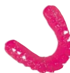
Splints for diagnostics Material: BRUX CHECKER®